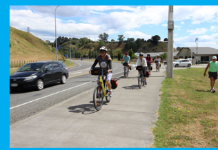
Church Road Pathway - Happy group of Aussies